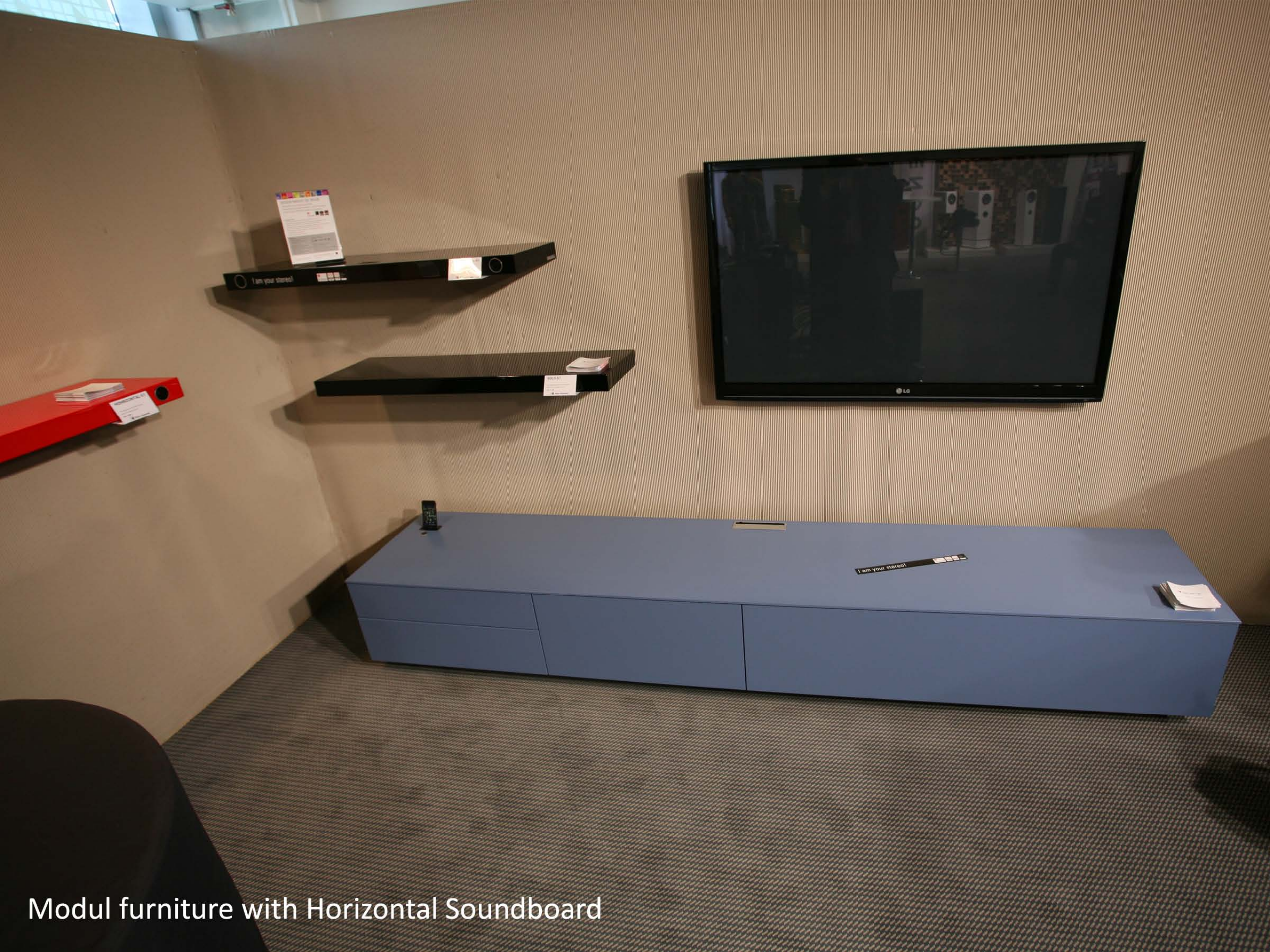
Modul furniture with Horizontal Soundboard