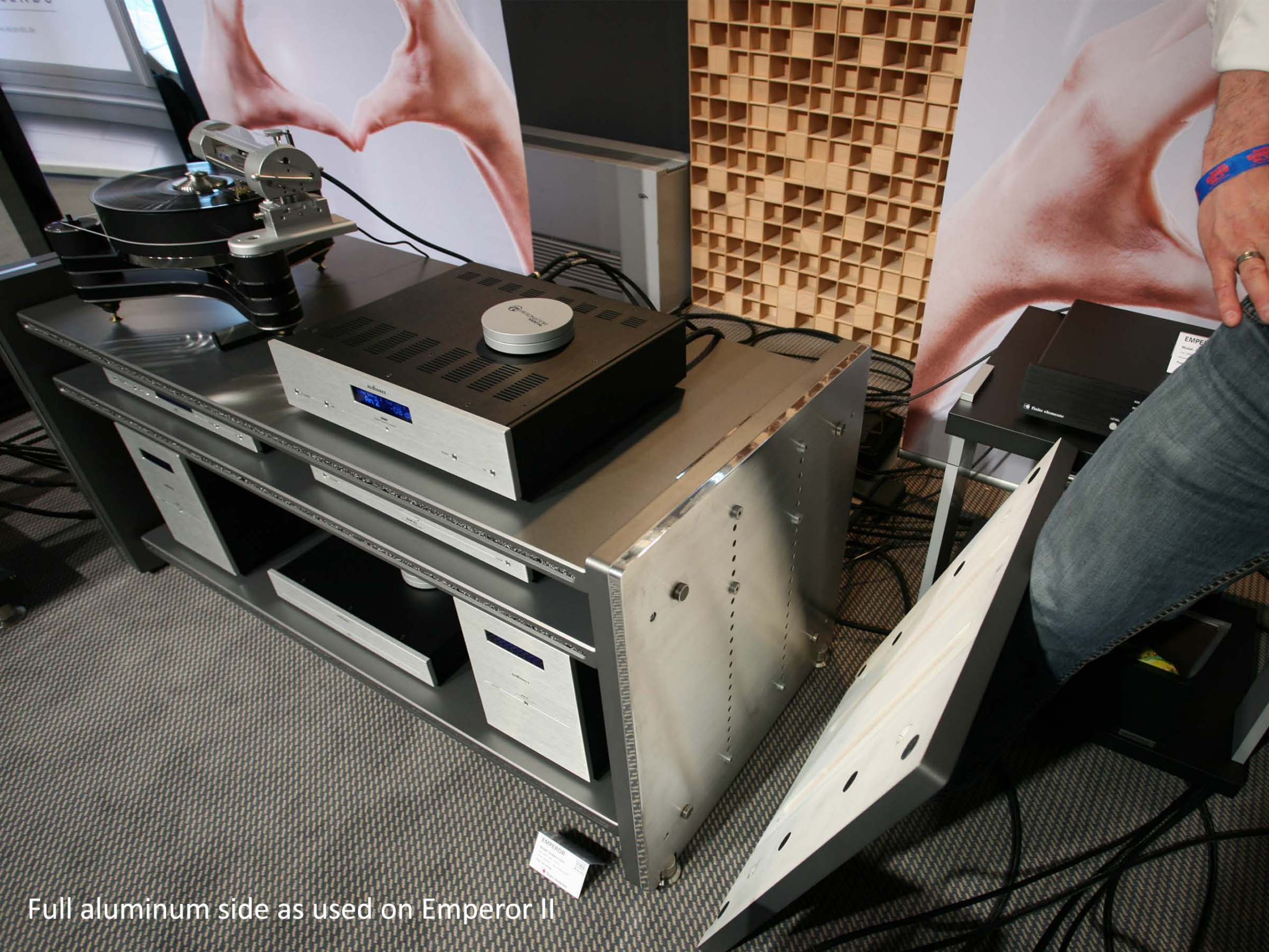
Full aluminum side as used on Emperor II