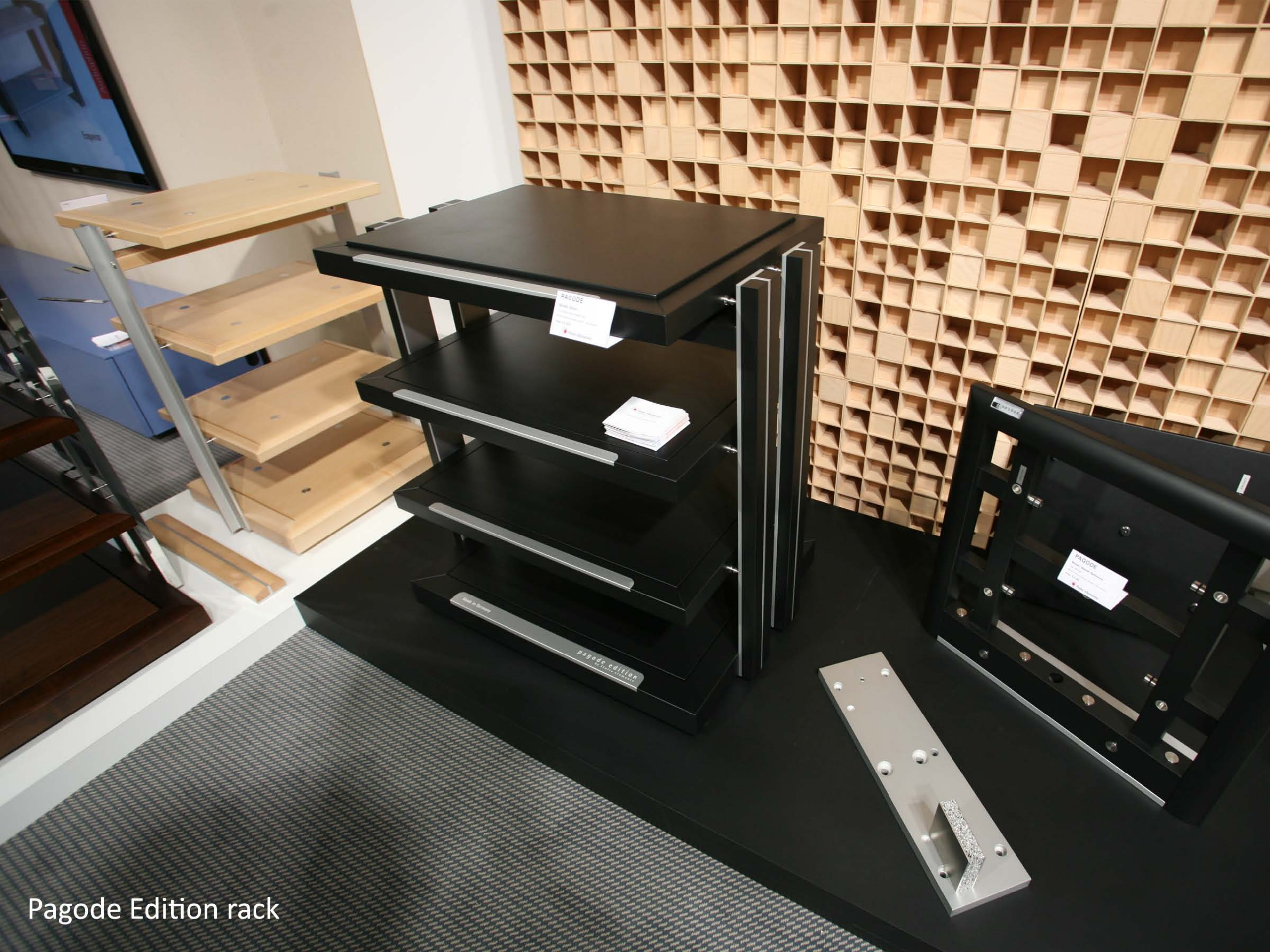
Pagode Edition rack