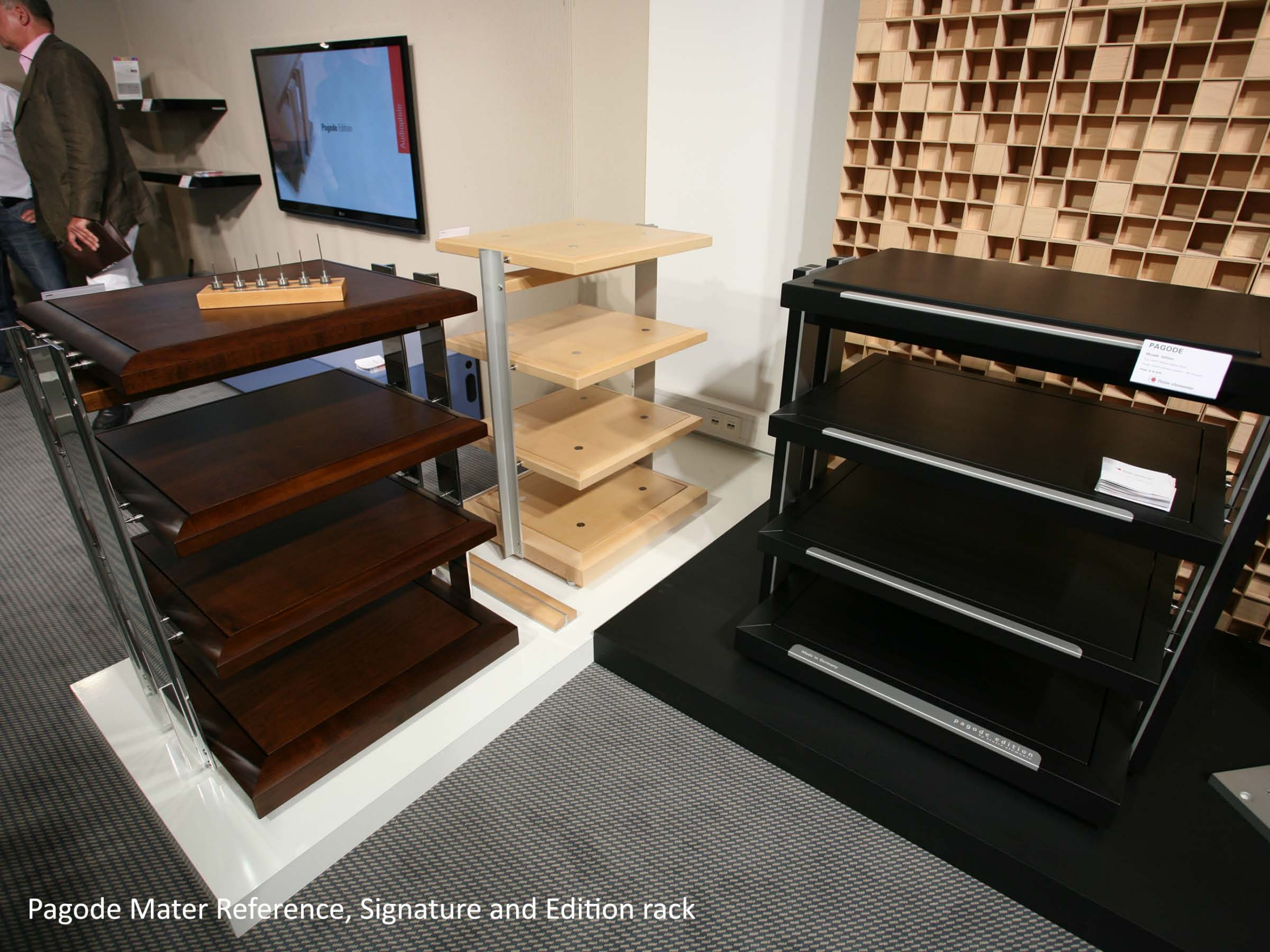
Pagode Mater Reference, Signature and Edition rack